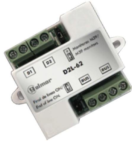
Dimensions: 45 (W) 45 (H) 17 (D) mm

GB2 is a pure 2 wires solution, the perfect system for villas and medium size buildings up to 22 apartments*. The system is very convenient for retrofit, thanks to its full digital transmission of audio, video and data. The system's wiring is not polarized, becoming GB2 an easy-to-install intercom solution. Reach its maximum performance using RAP-2150 cable.